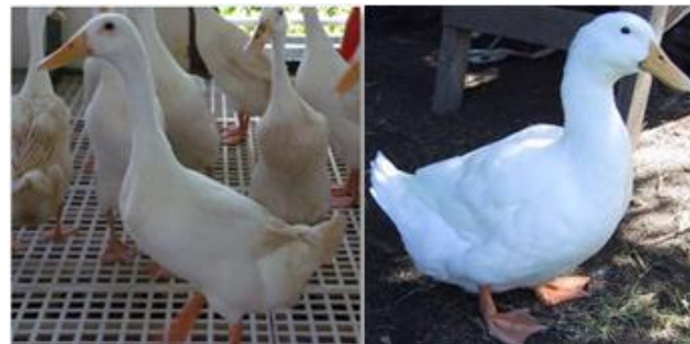
Figure 3. Mojosari (left) and Peking Duck (right)