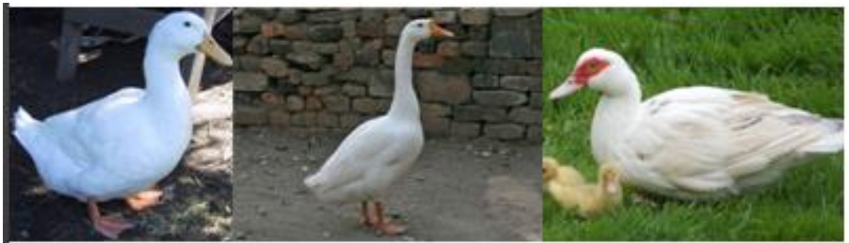
Figure 4. Duck (left), goose (middle), muscovy (right)