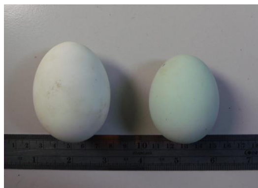
Figure 5. Duck's egg of Peking (left) and Mojosari (right)